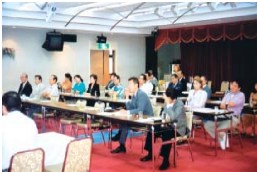
Many Okinawa chapter members participated in The Board was held in JA Gino Club House